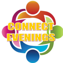
Table tennis, board games, nibbles and drinks, conversation, time to chill and relax. Please join us!

Don't miss our next 'Connect' evening this Friday 23rd February at 7.00pm in St Matthews - for all the church family and friends, all ages welcome.